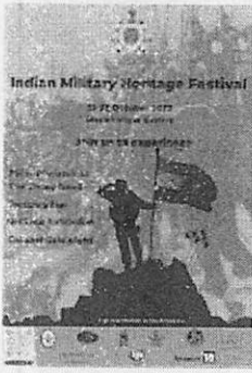
INDIAN MILITARY HERITAGE FESTIVAL (10).png 2274K